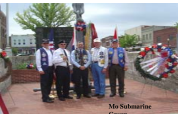
Mo Submarine Group at "Tiger Memorial" Mexico, MO